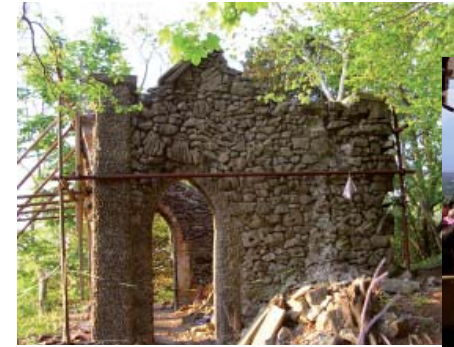
The pebble summerhouse

Over 200 visitors enjoyed the first open day of 2007 on the 20th May. The weather was perfect and visitor's had a tour of the bone cave and follies followed by a climb to the top of the tower and rounded their visit off with some home made cake and a cup of tea on the terrace admiring views across the Bristol Channel.