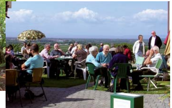
visitors enjoying refreshments on the terrace

left until a further stage of the restoration. If any one should have any old photos of the summerhouse, no matter how trivial, we would be delighted to see them, please telephone 820516. Many thanks to those